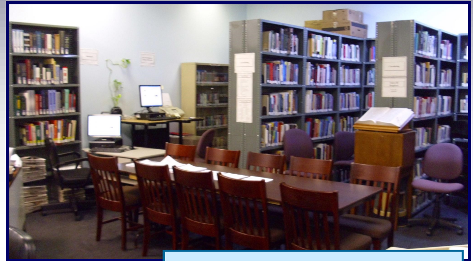
The Brighton Beach Campus Library in drier times.

Touro's Brighton Beach campus is located in southern Brooklyn, near the Atlantic Ocean and the Coney Island boardwalk. Hurricane Sandy devastated the neighborhood in October 2012, flooding homes and businesses for many blocks, including the building which houses the Brighton Beach campus library. The floodwaters inside the library were knee deep, destroying furniture, equipment, and all the books on the library's lower shelves. Nothing touched by the water was salvageable; all impacted materials had to be discarded. Once the waters receded, the clean-up and reconstruction began. The surviving books and equipment were packed away. Construction crews came in and took down the walls and removed the carpeting. Electricians replaced the wiring and electrical outlets throughout the facility. The room was painted and new linoleum was installed to replace the ruined carpets. After renovations were completed, all the rescued books were re-shelved.