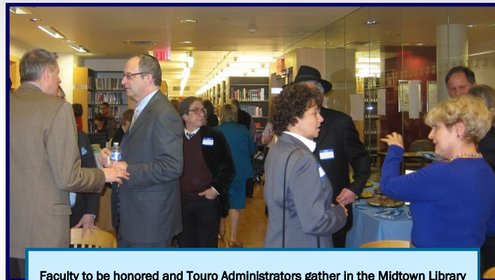
Faculty to be honored and Touro Administrators gather in the Midtown Library