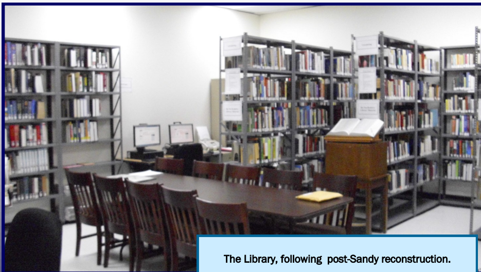
The Library, following post-Sandy reconstruction.

Sandy did a lot of damage, but as of April 2013, everything has been completely restored and the library is back to its fully operational status. After reopening to Touro students and faculty in February, the library is now up and running normally again.